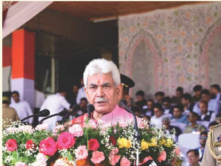
ing relationship and trust between government and the citizens.

13. On this auspicious day, I also urge every one of you to ask yourselves about the sacrifices you made in building Jammu and Kashmir of your dreams. What has been your contribution? What have you done for the welfare of society? These questions will inspire each one of us to serve the nation with renewed passion and vigor.