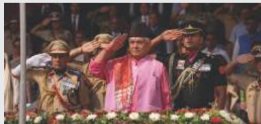
happiness," he said as per local news agency GNS.

"There is renewed enthusiasm and vigour among entrepreneurs for industrialization. New roads, tunnels, railway lines, power projects, airport terminals, industrial estates and shopping malls are being constructed and all around us we are witnessing the emergence of prosperity and